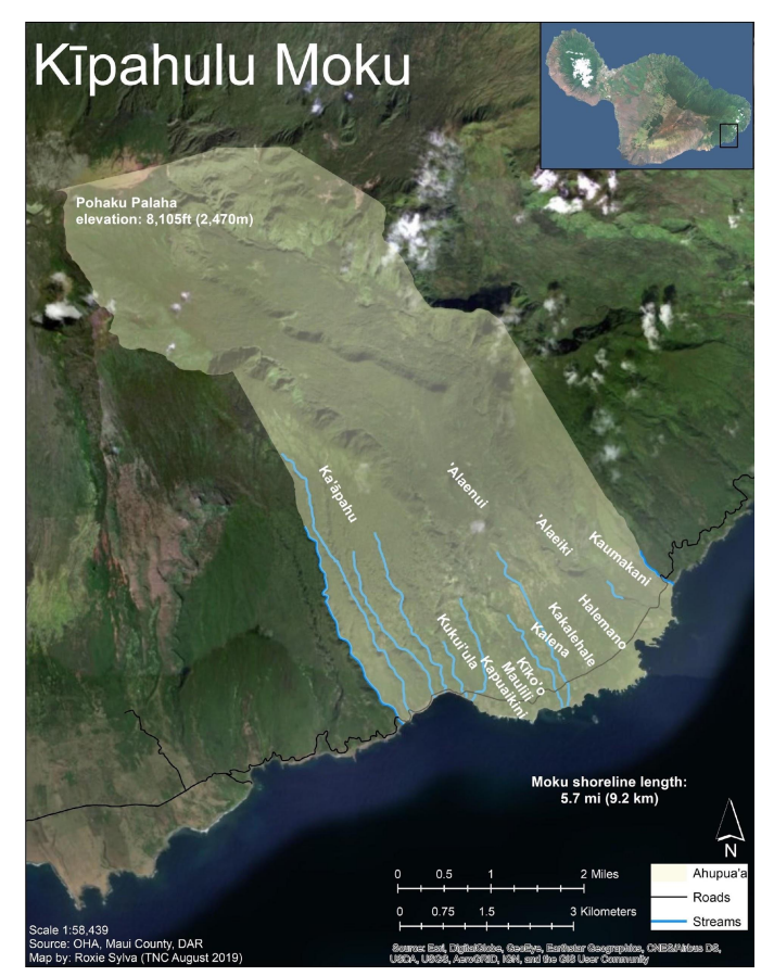
Figure 1. Map: Kīpahulu Moku Site Reference

exposed southeast side of Maui, south of Hāna and east of Kaupō, and is subject to rough sea conditions for much of the year. The moku is about 12,000 acres and